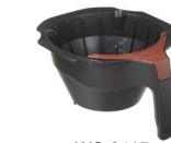
WC-3417 Brew Basket with Hot Coffee Splash Pocket