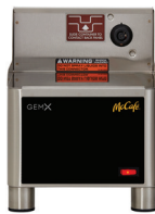
GEM5XSIFT10A026 Single Warmer Stand