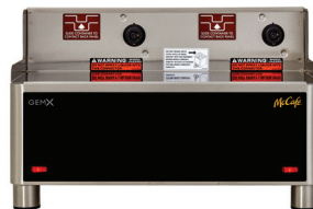
GEM5XTIFT10A026 Twin Warmer Stand