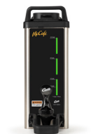
GEM3XNRBA026 1.5 Gallon Dispenser with FreshTrac