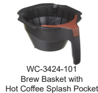
WC-3424-101 Brew Basket with Hot Coffee Splash Pocket