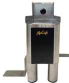
GEM5XNS10326 Single Warmer Stand