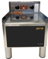
GEM5XN10A326 Twin Warmer Stand